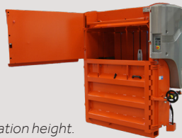
Regular door for extra low installation height.